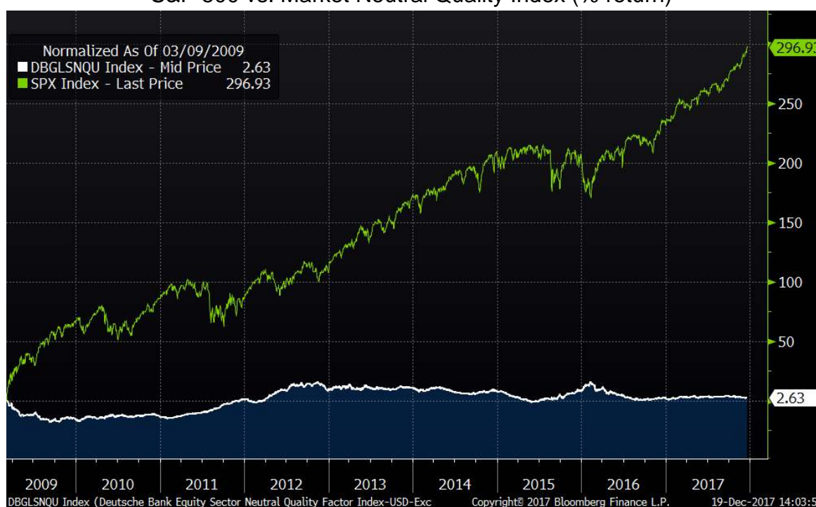
S&P 500 vs. Market Neutral Quality Index (% return)

For illustrative purposes only. Past performance is not indicative of how the index will perform in the future. Index returns do not reflect deductions for fees, expenses or taxes. The index is unmanaged and is not available for direct investment.