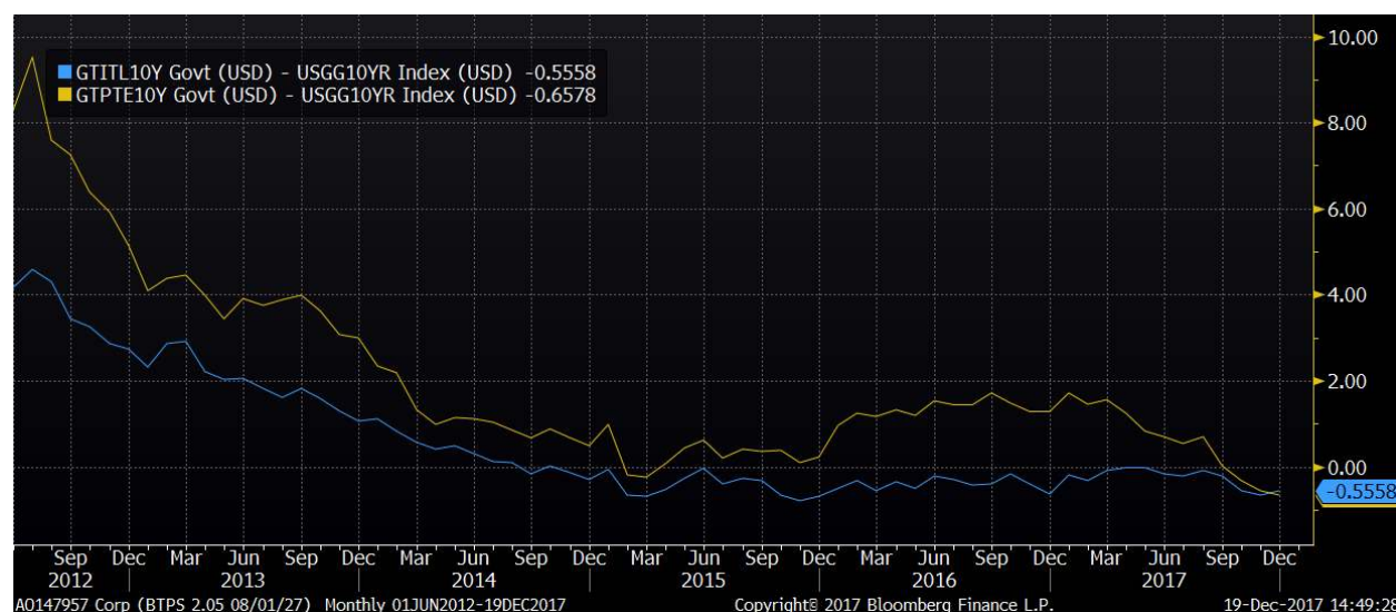
Difference in 10-Yr Yields: Portugal vs. U.S. (gold) and Italy vs. U.S. (blue)

For illustrative purposes only. Past performance is no guarantee of future results.